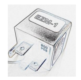
EZ-Lock Control Module

The EZCM is designed to plug-in to the starter relay socket. The first step is to locate the Truck's or Heavy Equipment's starter, neutral safety switch, or ignition factory relay and remove it. This install kit is for the unit you specified when you ordered this system. Unplug the factory relay and plug-in the EZCM. If this EZCM will not plug-in to the socket, stop the installation and please call us. The final step is to test the system by trying to start the installed vehicle. It should not start. Enter your 4 digit code using the WPP and press the single dot button. Now start the vehicle. You're done.