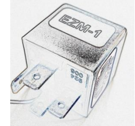
EZ-Lock Control Module

If you have issues please go to our web site; EZ-Lock.net for more answers or call 916-851-9073 for support 9-5 M-F PST.